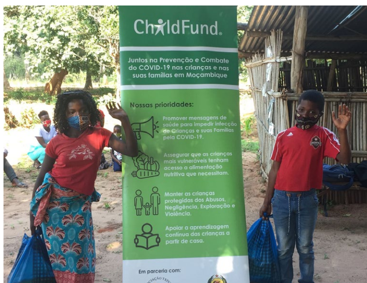
Children receiving food baskets in Mozambique.