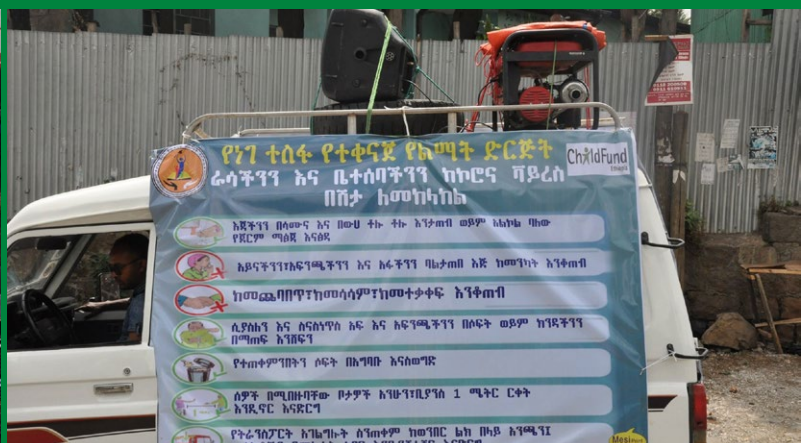
ChildFund Ethiopia staff conducting community sensitization on COVID-19 using a vehicle, banners and public address system.