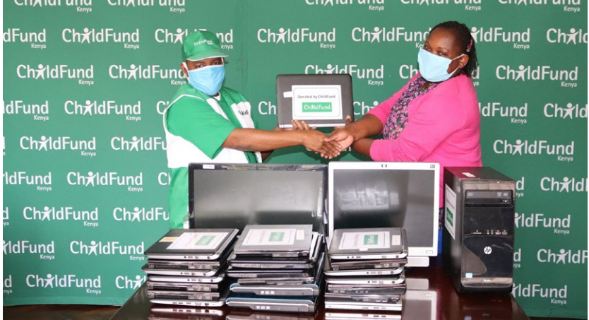
ChildFund Kenya donated 33 computers to Childline Kenya in support of the fight against child abuse. Childline works in partnership with the government to stop child abuse by offering the only nationwide helpline service dedicated to children that runs 24 hours toll-free.