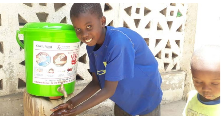
A boy washing his hands at a hand washing station installed by ChildFund Senegal.