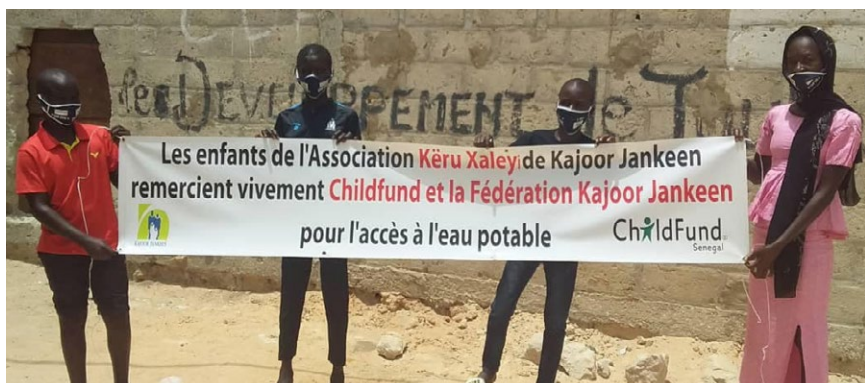
Children in Senegal from Kajor Jankeen Federation zone thanking ChildFund for purchasing a hydraulic pump to enable the functioning of a community borehole.