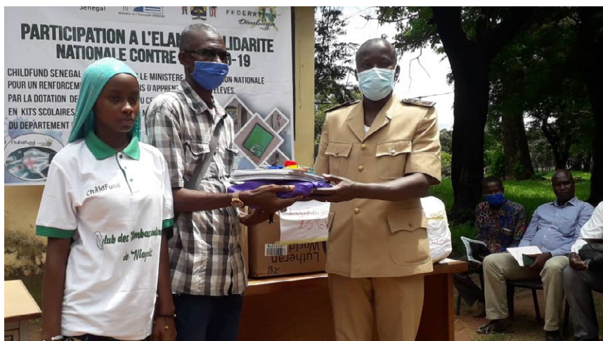
ChildFund Senegal distributing learning kits comprising of books and other study materials to children.