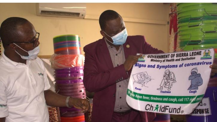
ChildFund Sierra Leone donated buckets, soaps and posters to the Ministry of Trade and Industry, for distribution in market places.