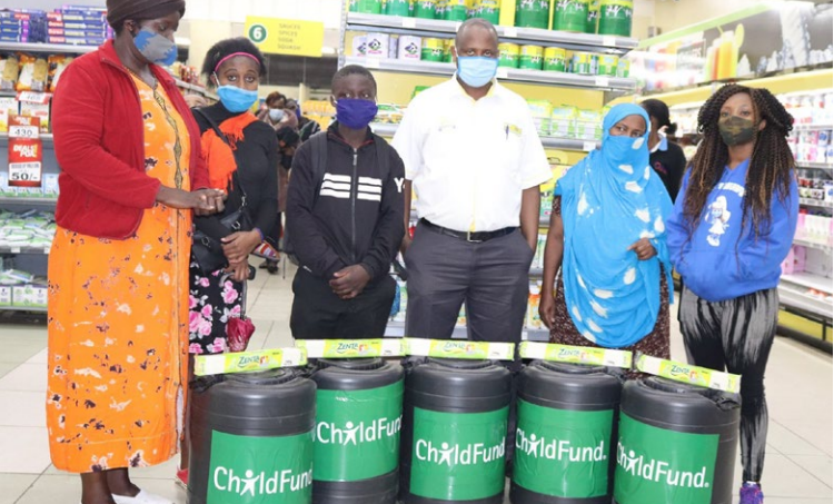
Families living in urban informal settlements buying water tanks and soaps from a supermarket through e-vouchers from ChildFund Kenya.