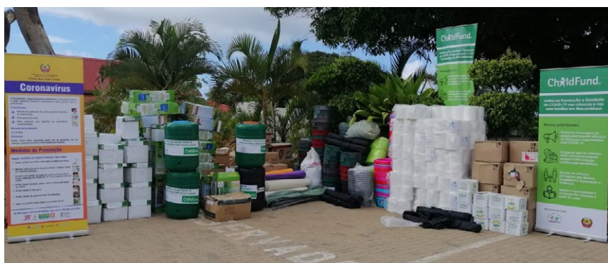
Donation of assorted PPEs and Infection Prevention and Control materials by ChildFund Mozambique to Ka Mavota and Zavala District governments.